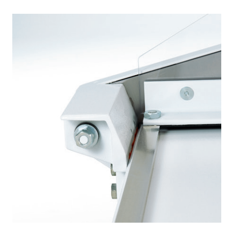
SOLID BLADE MOUNTING BRACKET

For efficient and easy cutting: Standard paper sizes from A6 to A3, American sizes (letter, legal, ledger size) and various angle indications printed on the table.