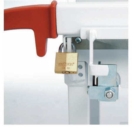
BLADE LOCKING DEVICE

Sturdy design: Cast aluminium blade mounting bracket with double pivot bearings for the blade axle guarantees highly accurate rectangular cuts.