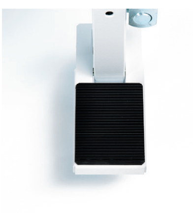
FOOT PEDAL CLAMPING

The front gauge with integrated narrow strip cutting device is positioned via a calibrated rotary knob. A fold-away extension table supports the material to be cut, especially useful when trimming large formats.