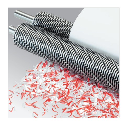
SOLID STEEL CUTTING SHAFTS

Robust and durable: high-quality paper clip proof cutting shafts with lifetime guarantee under conditions of fair wear and tear.